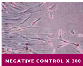
NEGATIVE CONTROL X 200