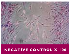
NEGATIVE CONTROL X 100